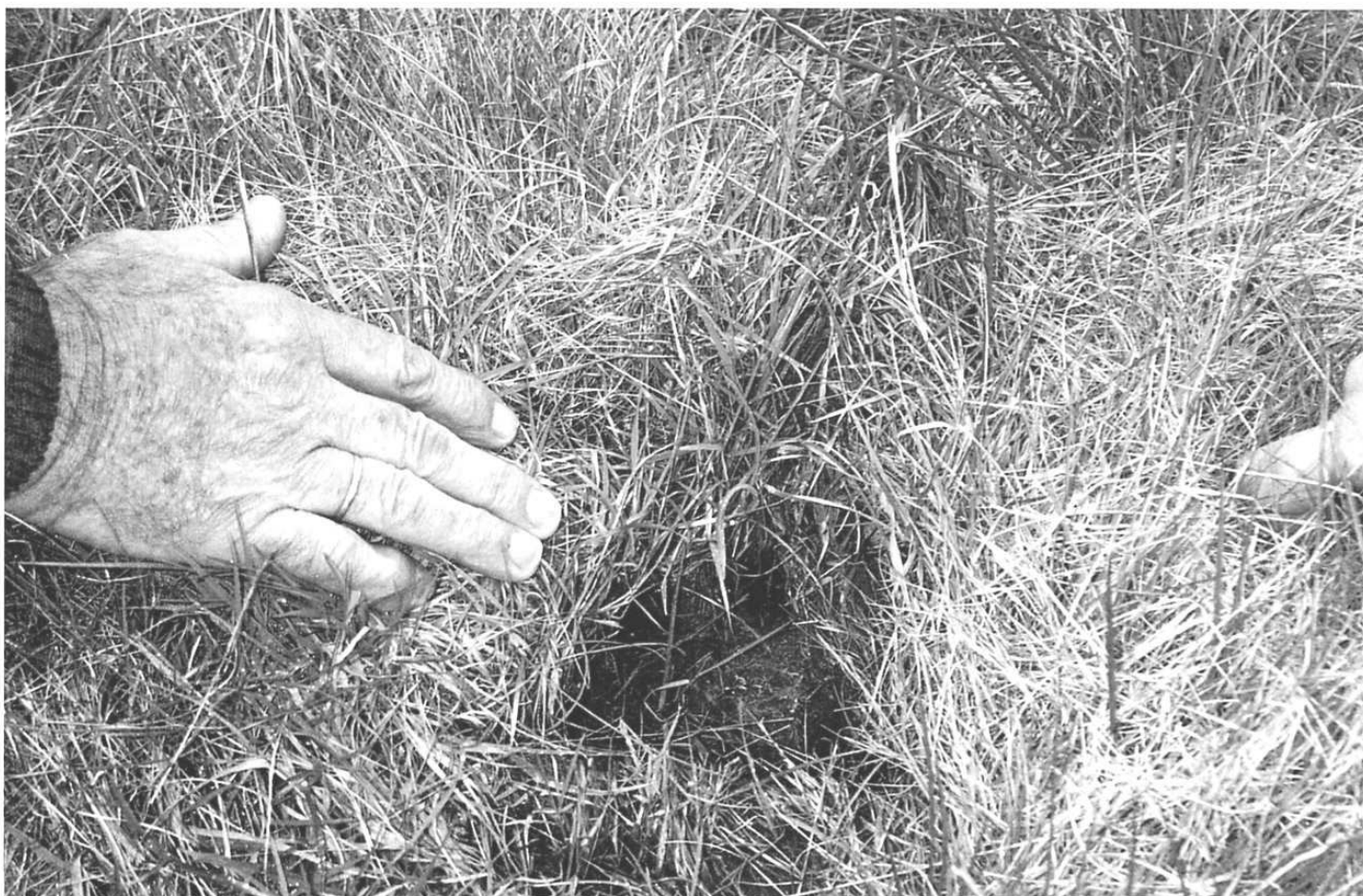
" One whole field was full of imprints like this. "