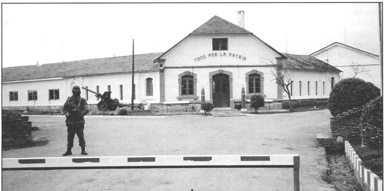
The Spanish Army Barracks at Las Gandaras. Large UFO hovered low overhead.

It all started at 10.45 pm on November 27 of last year (1995), over the military base of Las Gandaras, in the Province of Lugo. A triangular-shaped UFO with a large light in each of its corners was observed by the